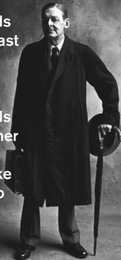
- T.S. Eliot, "Little Gidding"

“For last year's words belong to last year's language And next year's words await another voice. And to make an end is to make a beginning.”