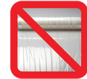
PLASTIC FILM & BUBBLE WRAP