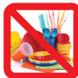
SOLO CUPS & PLASTICWARE