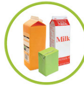
CARTONS & JUICE BOXES