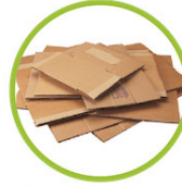
CARDBOARD BOXES (FLATTENED)