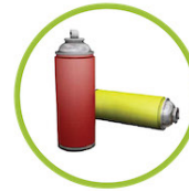
EMPTY AEROSOL CANS