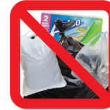
PLASTIC BAGS AND TRASH