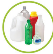
PLASTIC CONTAINERS (with necks only)

If It's Not Listed In The Green Circle Below DO NOT Recycle It In Your Curbside Recycling Bin!