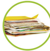
PAPER (BROWN BAGS, HIGH-GRADE PAPER)