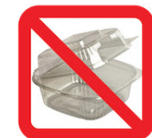
PLASTIC FOOD CONTAINERS